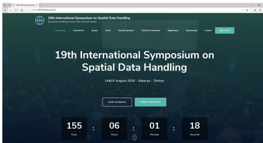
The website of SDH 2020

We published the website of the symposium of SDH 2020, and posted the CFP and posters of the SDH 2020 on Google group. The commission members will help spread the symposium information in their countries.