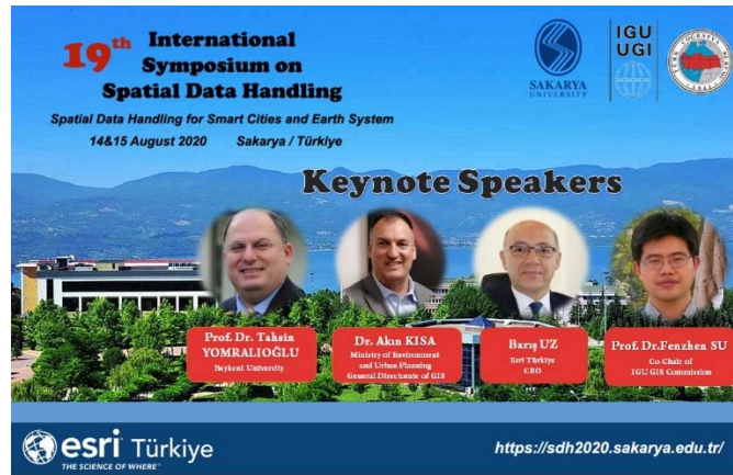
The posters for SDH 2020